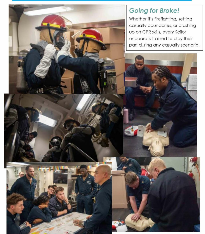
July 22, 2024 Edition 1, Volume 8