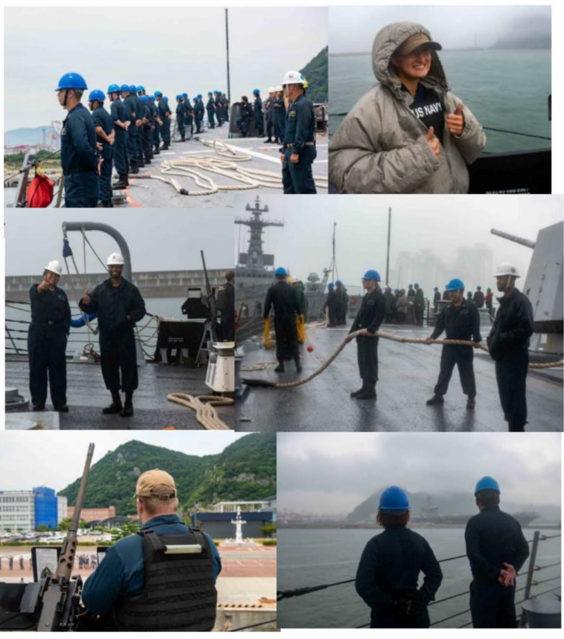
July 22, 2024 Edition 1, Volume 8